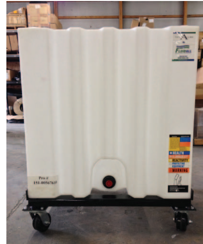
120 Gallon Tote