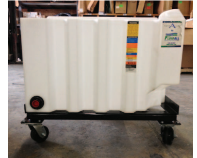
Stackable 70 Gallon Tote

24" Stands support your stackable 70 and 120 gallon totes